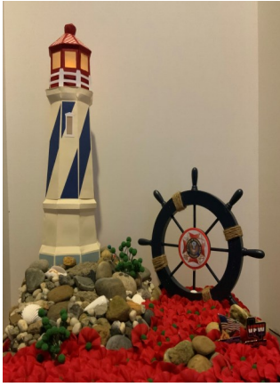
"Keeping Our Shores Safe"